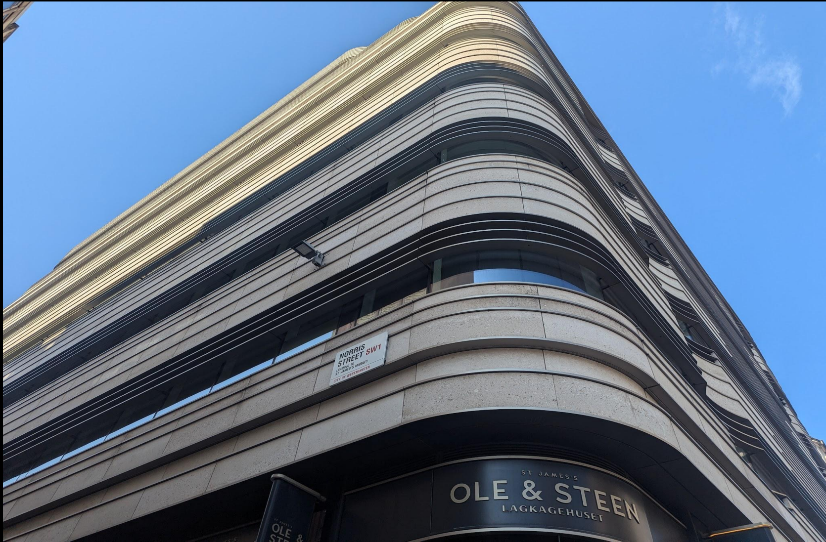
St. James's market, London