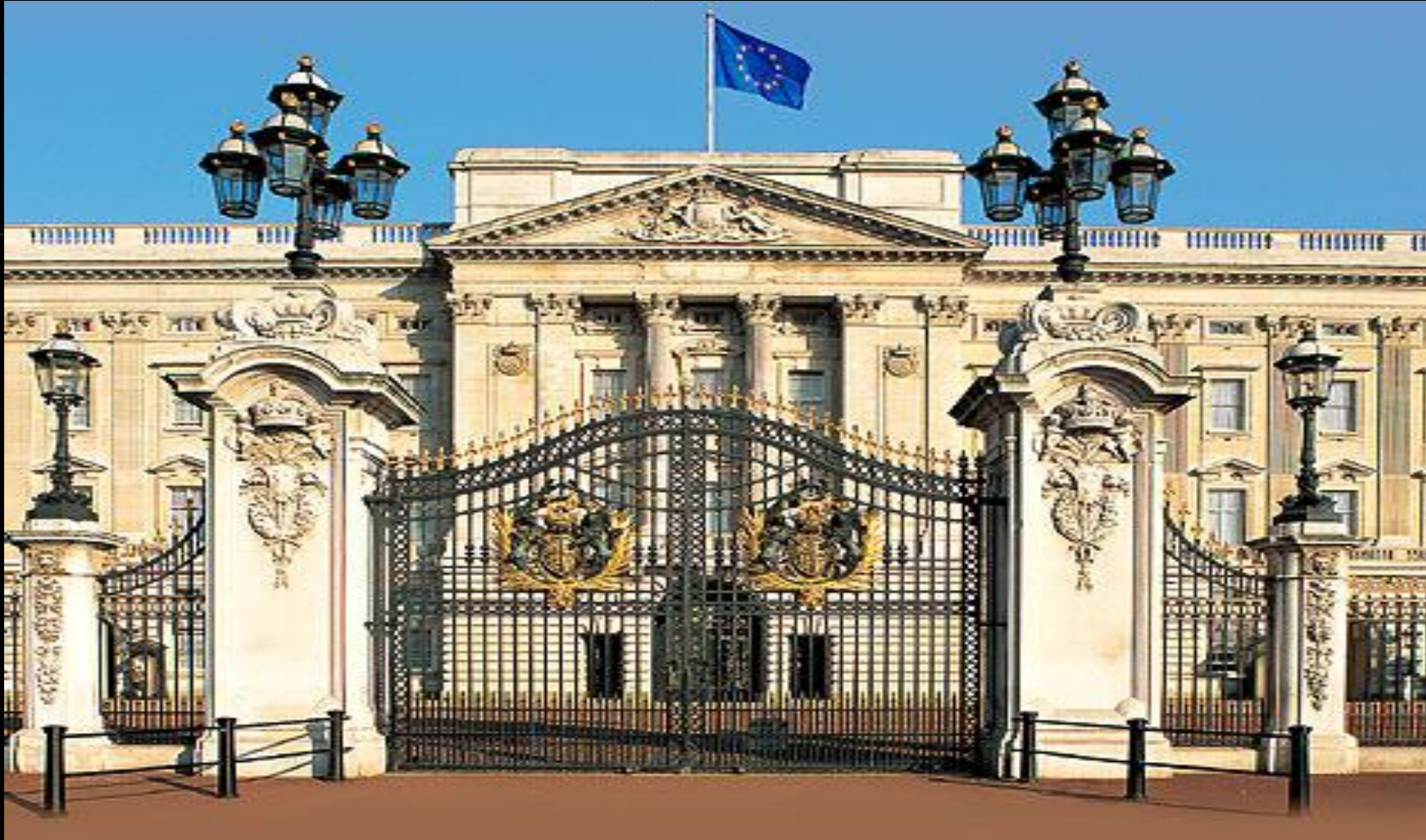
Buckingham Palace The East Front, redesigned in 1913, utilizes the stone to represent sovereign permanence.