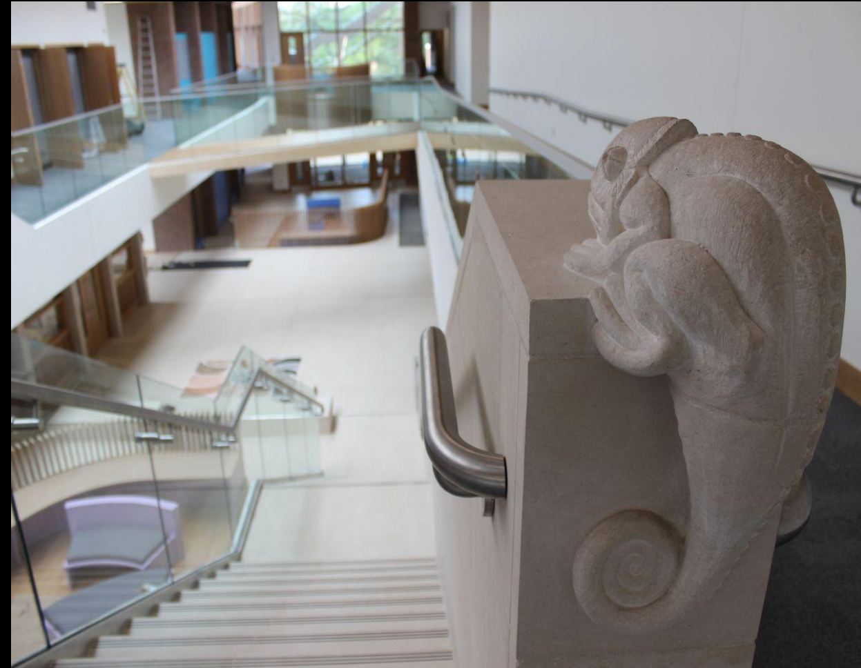
Highgate junior school, London